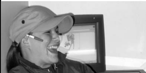
Courier Sunny relaxes with colleagues at the office after work.

With your help we can keep the couriers busy and create even more opportunities for young people to turn their lives around!