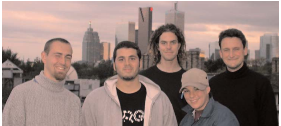
The TurnAround Couriers Team

Of the four receptionists who have worked with us, one is now attending George Brown College, one is working in Guelph, and another has secured work through PD Bureau, a temp agency and TurnAround Couriers client.